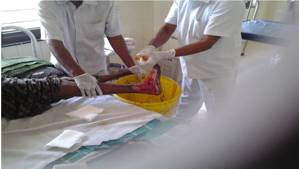
Figure 1: Patient with necrotizing fasciitis