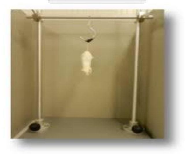
Fig: 1 Synergistic Anti-depression of Eucalyptus and Neem oils on Tail

Male or female rats were used with a body weight (20–25 g). They are placed in plastic cages for testing in the experiment and in a 12 h light and dark cycle and fasting overnight. Animals are transported from the housing room to the testing area and allowed to adapt to the new environment for 1 h before testing. Groups are divided into control, test and standard and each may contain 2 animals. Drugs were given by oral route by the garage. For the test, the mice are suspended on the edge of a shelf 58 cm above a table top by adhesive tape placed approximately 1 cm from the tip of the tail. The duration of immobility was recorded for periods of 5 min. Mice were considered immobile time recorded by stopwatch when they hang passively and completely motionless for at least 1 min [3].