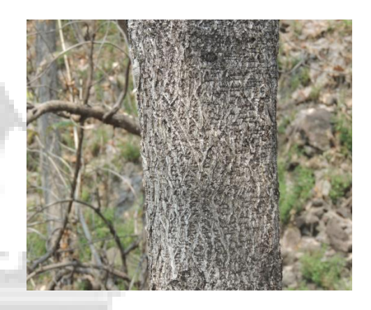
Fig.1- Albizia julibrissin Durazz. Flower Fig.2- Albizia julibrissin Durazz. Stem