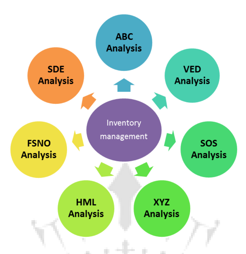
Figure: 1 Types of inventory management techniques

ABC :- This would depend upon annual consumption cost of items and not on unit price of the items. This is control on cost basis.