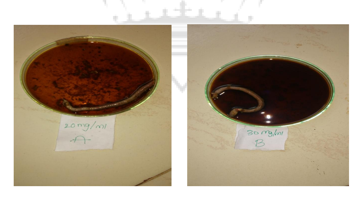
Table no 2: Anthelmintic activity of aqueous extract of Zaleya decandra and standard Albendazole.