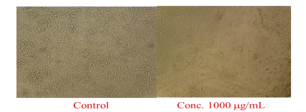
Figure 2: Cytotoxic activity on A- 549 Cell lines by Beauveria bassiana ethyl acetateethanol extract

Cytotoxic activity was one of the key activities for the entomopathogenic fungi that affect the cells of the insect to make them parlayed. For this process, entomopathogenic fungi release many compounds that are toxic to the insect cells. As insect cells belong to eukaryotic there might be similar effect observed in human cells. Cytotoxic activity one of the key searches for the developing compounds against cancers. Ethyl acetate extract of B. bassiana showing the strong cytotoxic activity of 117% growth inhibition (GI) on lung carcinoma cell line (A-549), similar results were reported with Beauveri feline strains on HL-60 (leukemia), B16 (melanoma) and HCT8 (colon) cancer cell lines[22].