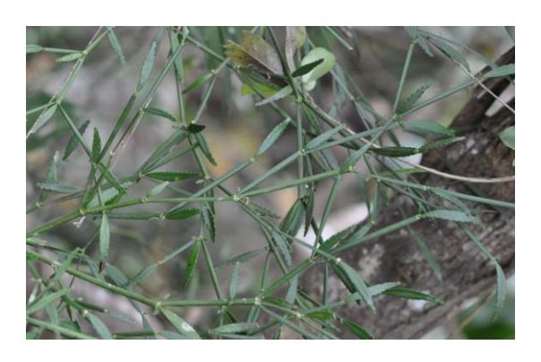
Fig. 1: Leafy branches of Cladogelonium madagascariense L. (tsontso) (EUPHORBIACEAE)