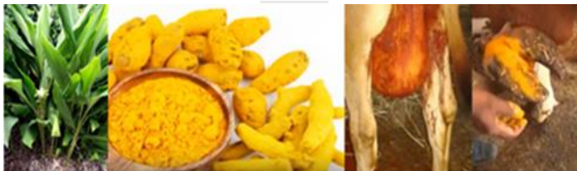
Figure No. 1: Ethnoveterinary medicinal plants, part(s) used and symptom(s) in cattle:

BQ – Paste is applied Twice in a day (M – E) for 7 days; SD – Paste is applied Twice in a day (M – E) for 7 days; II – Paste made to balls, Twice a day (M – N) for 7 days; HF – Paste is applied/ tied over horn and left for 7 days; BF – Paste applied once in (3 days interval) for 15 days; CW – Paste is applied Twice a day (M – N) for 7 days; Ectoparasites – Paste is applied as similar to an ointment on skin surface twice a day (M – N) for 7 days; Mastitis – Paste applied twice a day (M – N) for 3 days; FMD – 250 ml, thrice in a day (M – N – N) for 7 days; Stomach-ache – 500 ml, twice a day (M – N) for 2 days.