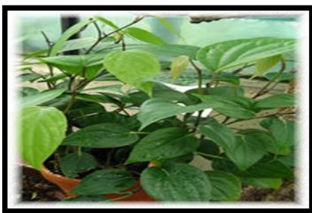
Figure No. 1: Piper cubeba Leaves

The fresh leaves of Piper cubeba were collected from Sant Gajanan Maharaj Medicinal & Herbal garden, Mahagaon Site- Chinchewadi Taluka- Gadhinglaj Dist- Kolhapur (M.S.). These leaves are washed thoroughly in distilled water and the outside water was removed by air drying under shade.