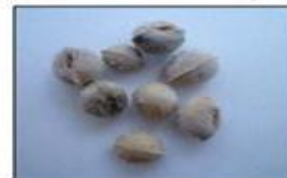
Fig. 7 Tinosporacordifolia seeds