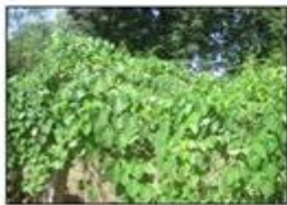
Fig. 1 Tinosporacordifolia plant