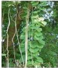
Fig 1: Tinospora cordifolia

Tinospora Cordifolia is a climbing shrub that belongs to the family Menispermaceae which is commonly known as Guduchi, Amrita, Gurach, Tinospora. Giloy is a large, glabrous deciduous climbing shrub. The stems of this plant are rather succulent with long filiform fleshy aerial roots from the branches. The bark of it is gray brown in colour and watery. The leaves having membranous and cordate shapes. The flowers are small and greenish yellow. Tinospora cordifolia is found throughout tropical Asia ascending to a height of 300 mts. [1]