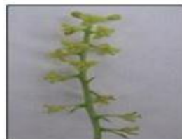
Fig. 5 Tinosporacordifolia flowers