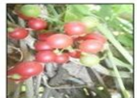
Fig. 6 Tinosporacordifolia fruits