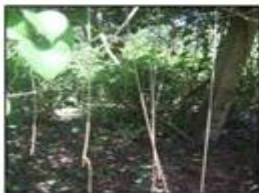
Fig. 3 Tinosporacordifolia aerial roots