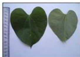
Fig. 4 Tinosporacordifolia leaves