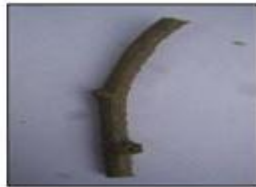
Fig. 2 Tinosporacordifolia stem