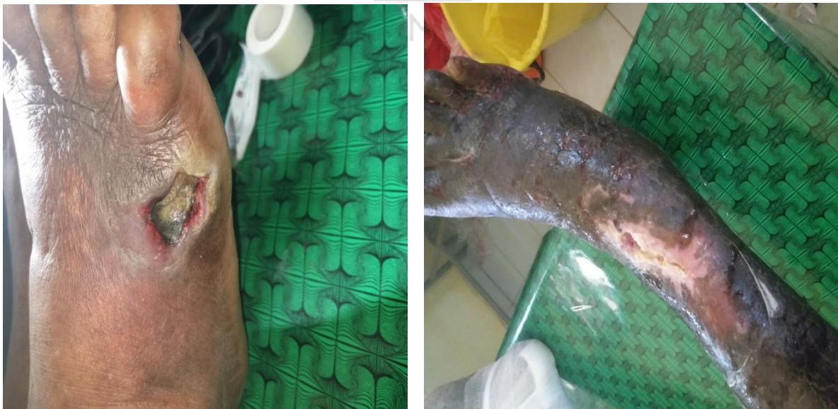
Fig 1.1 Grade 2 and grade 3 diabetic foot ulcers

Diabetic foot ulcers are the most devastating, chronic and costliest complication of diabetes. DFU as defined by WHO is “an ulceration of foot associated with different grades of ischemia, neuropathy and infection”. If diabetic foot is not treated properly it can lead to its extremely devastating complication, that is, lower limb amputation. Diabetic foot ulcers can evoke a galore of complications with lower limb amputation being the dreadful one. It can bring months of hospitalization and enormous expenses.