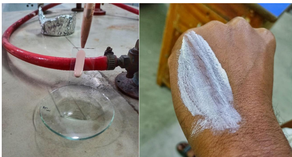
Figure No. 5: v. spreadability test vi. skin irritation test