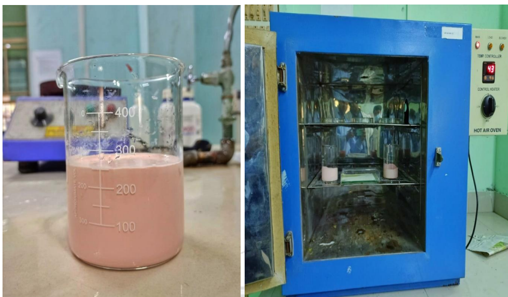
Figure No. 4: iii. physical appearance iv. Stability test

2 ml of the formulation was taken, applied to the skin of the hand first then to the backside of the ear. It produces no skin irritation after 30 min.