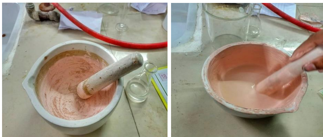
Figure No. 3: