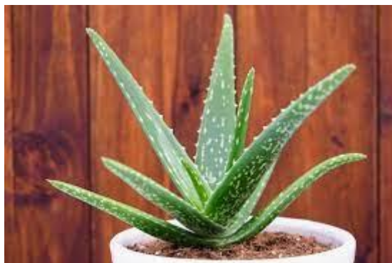
Figure No. 1: Aloe vera