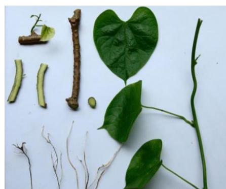
Figure No. 1.2: Giloy leaves, stems, and roots.