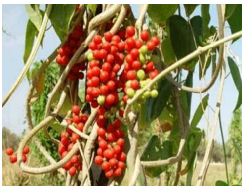
Figure No. 1.1: Fruits of Giloy

The name is derived from its cardiovascular leaves and shrimp berries. The lamina is widely oblong and ovate, 10-20 cm long and 8-15 cm (3-6 in) wide and 7 nerve and deep corded at the base, cone-like, pubescent above, and a white tomentose beneath with a remarkable reticulum. Flowers are tiny, greenish-yellow, unisexual, emerges on axillary and terminal racemes, when the plant is leafless. Male flowers are grouped, while the female flowers are generally present as single. There are six sepals in two sets of triplets. The external flowers are smaller than the insider ones. Petals are smaller, obovate, and membranous than sepals. The fruits are aggregated in one to three clusters. Fruits are ovoid, fleshy, reddish having a single seed. Fruiting is seen in September-October. On stout stalks with sub-terminal scars, scarlets, or orange colors. They avoid smooth drupelets. [4, 8]