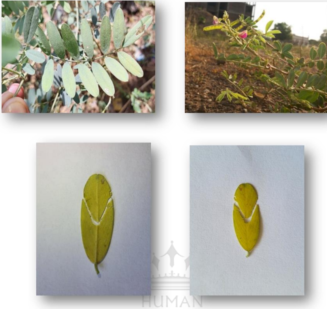
Fig. No. 1: Showing a. whole plant, b. Compound leaves of Tephrosia purpurea ; c. Plant with legumes and flower; d,e. V shape break of leaf (inner and upper portion of leaf)

Distribution: It is widely distributed in the Indian subcontinent, Tropical, and South Asia, West Asia, South China, Malaysia, North Australia. It has a pantropical distribution. It is a weed found commonly in wastelands. 6