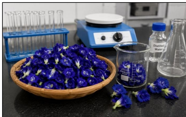
Fig3: Collection of Blue Pea flower

Fresh flowers of Clitoria ternatea were collected from a suitable source. The flowers were carefully selected and washed thoroughly with distilled water to remove dust, dirt, and other impurities.