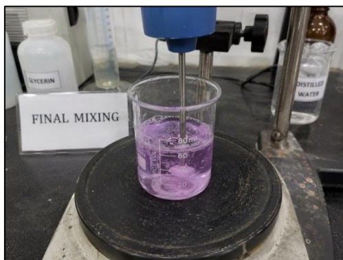
Fig12 Final Mixing

The complete formulation was stirred continuously until a uniform, smooth, and clear serum was obtained.