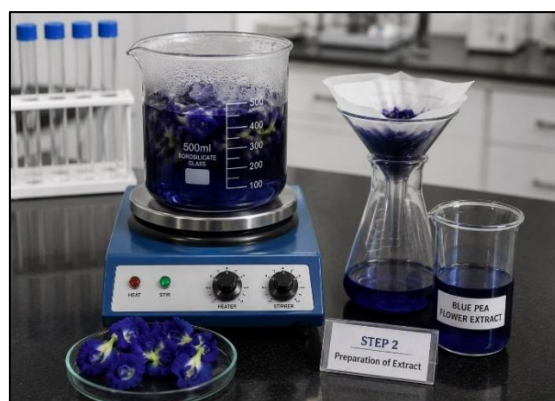
Fig5 Preparation of extraction of flower

The dried flower powder was mixed with distilled water and kept for extraction by maceration method with continuous stirring. After extraction, the mixture was filtered using muslin cloth and filter paper to obtain clear Clitoria ternatea extract.