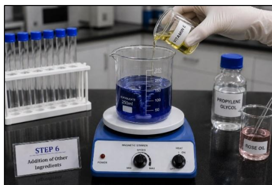
Fig9 Addition of other Ingredients

Vitamin E, propylene glycol, and rose oil were added one by one with continuous stirring. Vitamin E acts as an antioxidant, propylene glycol improves absorption, and rose oil provides fragrance and soothing effect.