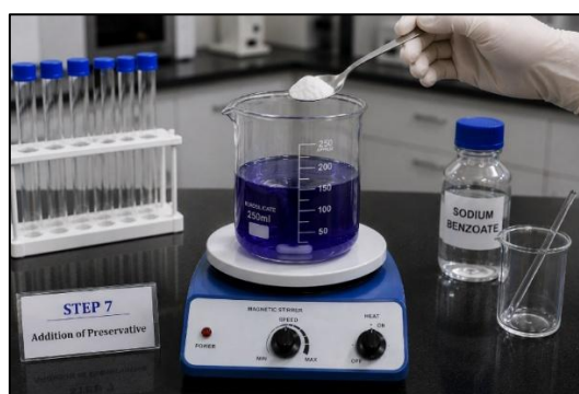
Fig10 Addition of Preservative

Sodium benzoate was added as a preservative to prevent microbial contamination and improve shelf life of the serum.