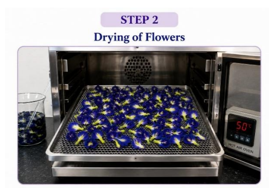
Fig4: Drying of flower

The collected flowers were shade dried at room temperature for several days to remove moisture content. Shade drying was preferred to protect the active phytoconstituents present in the flowers from degradation caused by direct sunlight.