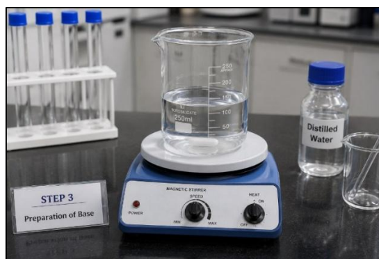
Fig6 Preparation of Base

A required quantity of distilled water was taken in a clean beaker. Glycerin was added as a moisturizing agent and mixed properly. Propylene glycol was then added slowly with continuous stirring to obtain a uniform base.