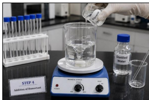
Fig7 Addition of Humectant

Glycerin was added into the base and stirred properly. Glycerin acts as a humectant and helps in maintaining skin hydration and moisture.