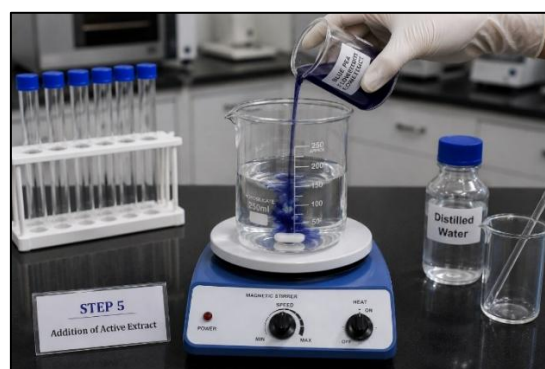
Fig8 Addition of Active Extract

The prepared Clitoria ternatea extract was slowly added into the solution with continuous stirring to ensure uniform distribution throughout the formulation.