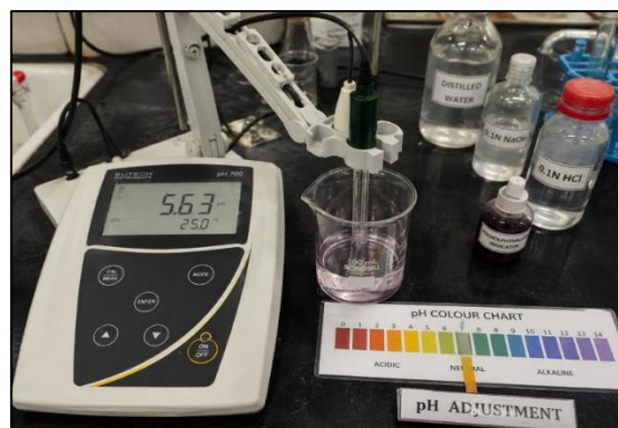
Fig11 pH Adjustment

The pH of the formulation was adjusted to about 5.0–6.0 using citric acid solution to make the serum suitable and safe for skin application.