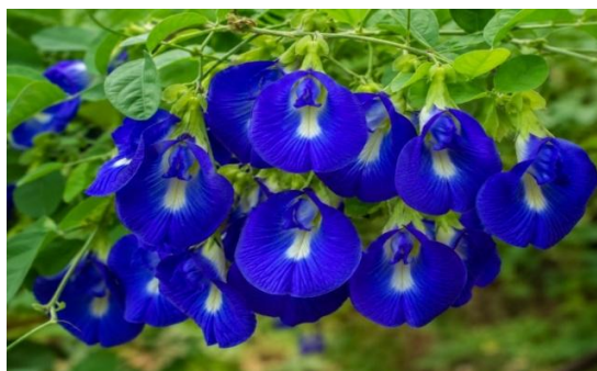
Fig.1: Blue pea Flower

Additionally, oxidative stress caused by reactive oxygen species (ROS) can damage skin cells and lead to aging and other disorders. The antioxidant compounds in Clitoria ternatea help reduce this damage, making it an ideal ingredient for herbal skincare products like serums.